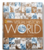
Visual History of the World Book